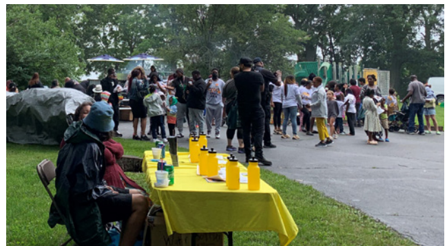
Black Academy event

Illinois Extension and the stakeholders of Zion are partnering to ensure that the city can thrive as we achieve health equity together.