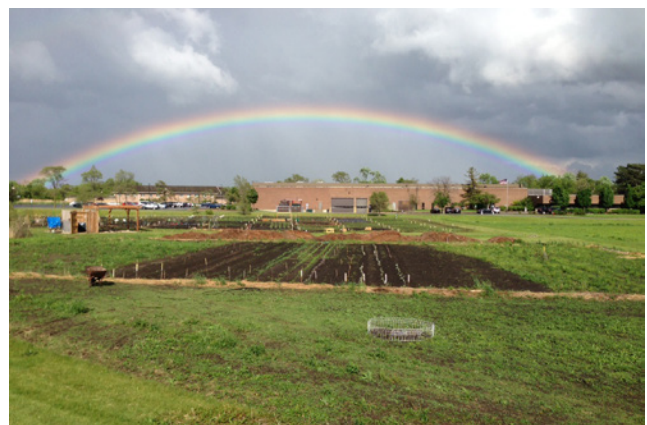
Amazing rainbow hovers over the Chapel Care Garden in Libertyville.

Volunteers harvested 14,188 pounds of fresh produce that supplied nearly 94,000 servings of vegetables to local families. From seed to table, this is a truly massive undertaking with incredibly impactful results.