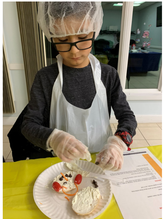
Avon Township - Kid chef learning how to make a healthier meal.